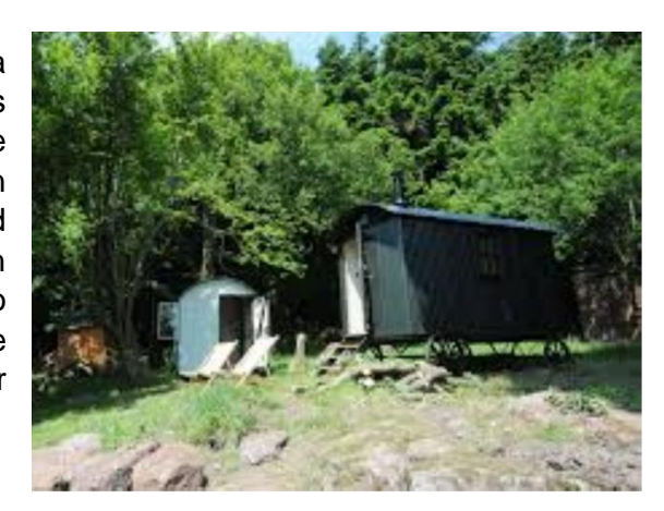
Shepherd's Hut, Penallt

19th and 20th century version of a modern caravan. Shepherd's huts typically comprise a solid wooden frame on cast iron wheels with corrugated iron roof and sides. Often have beds, wood burners and other facilities. As with wooden pods, they are transported onto a site as a complete unit. They cannot be categorised as touring units given their greater degree of permanency.