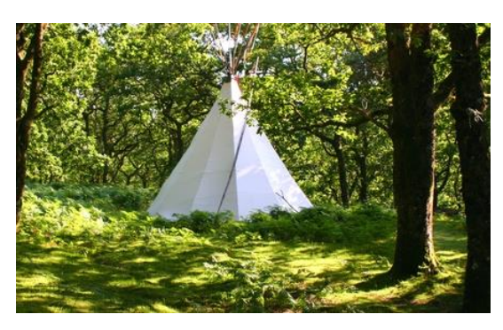
Tepee, Powys

Conical shaped tent comprising rounded wooden pole frame covered with canvas. Tepees often have wood burners and beds. Typically larger, more complex to erect and more permanent than traditional tents given their wooden bases which generally remain in situ throughout the year. Upper parts of the structures can be easily removed.