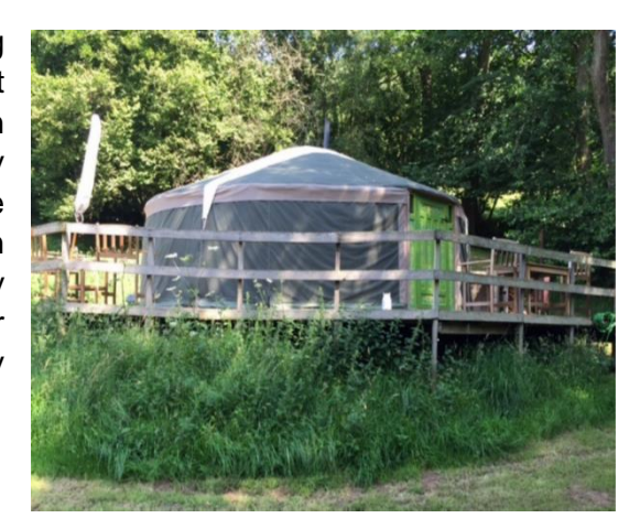
Yurt, Hidden Valley Yurts, Llanishen

Large circular tent structures, comprising a latticed wooden frame with felt insulation and canvas cover. Yurts often have wood burners and beds. Typically larger, more complex to erect and more permanent than traditional tents given their wooden bases which generally remain in situ throughout the year. Upper parts of the structures can be easily removed.