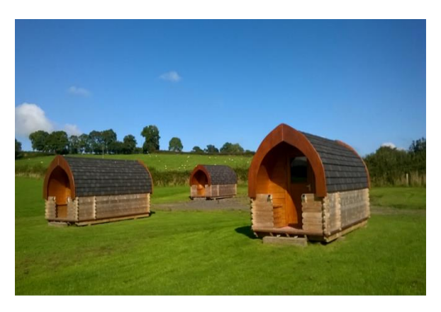
Wooden Pods, Llantillio Croesenny

Typically simple timber structures comprising a floor, sides and roof with no services although it is recognised that some types of pods/tents incorporate beds/heaters and may be connected to services. Wooden pods/tents are generally transported onto a site as a complete unit and simply placed on land (no foundations). They cannot be categorised as touring units given their greater degree of permanency.