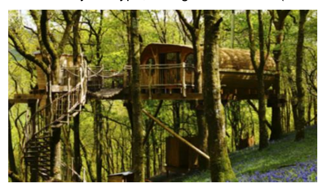
Tree House, Powys

Structures built next to and/or around tree trunk/branches above ground level. Some have beds/ facilities while others comprise a single open space /no facilities. Can vary considerably in type, design and scale (this would determine whether it would